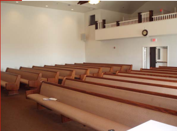
Pews / Seating