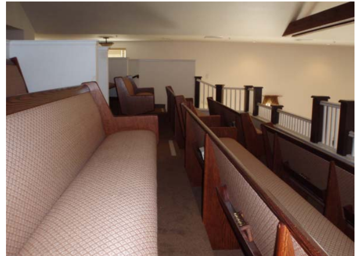
View of Balcony